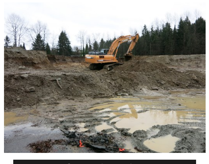
Construction continues - earth removal is now the major project