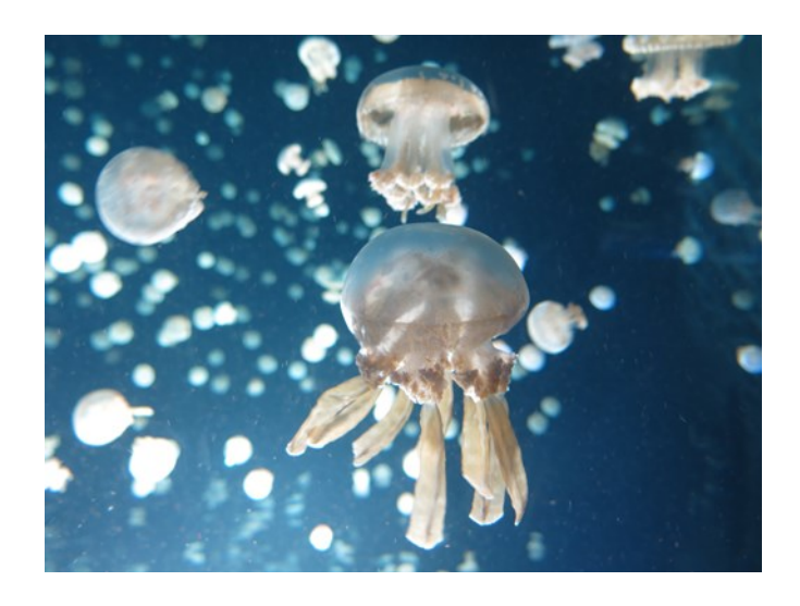
What does a shark eat with peanut butter? JELLYFISH!!